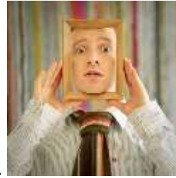
Self-portrait "through a frame".

USE REFERENCES! Emphasis on CREATIVITY, COMPOSITION, CRAFTSMANSHIP Use a Compositional Device!